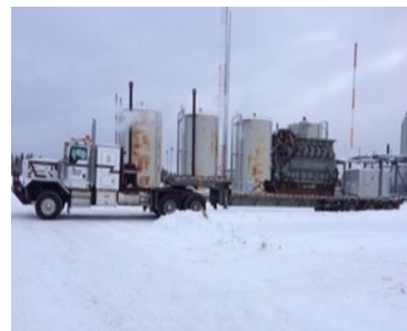
Core Engine Transportation