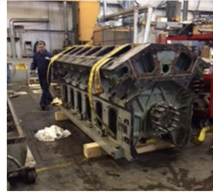
Tear Down Process