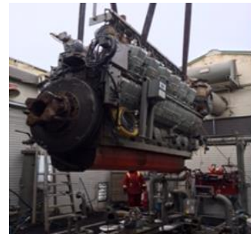
Core Engine Removal