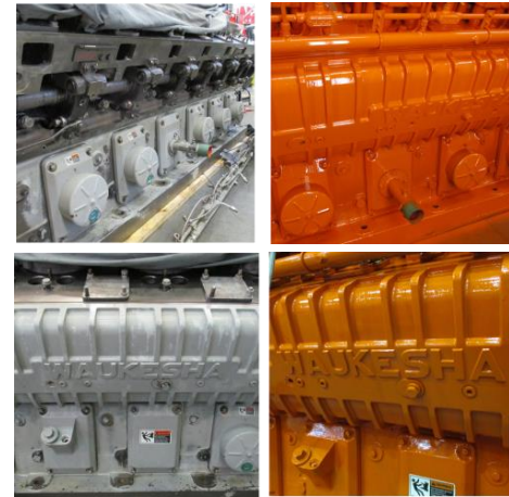
Before Process – Work in Progress